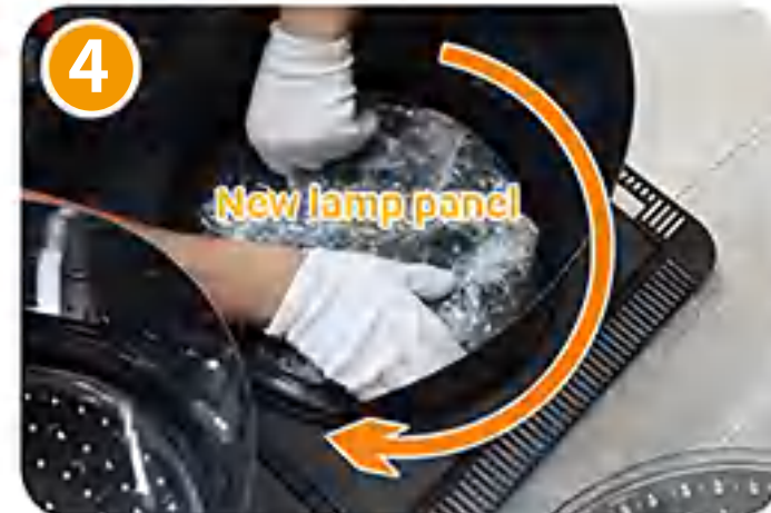
Install new light panel