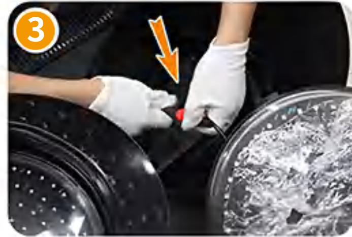
Unscrew the cable and unplug it