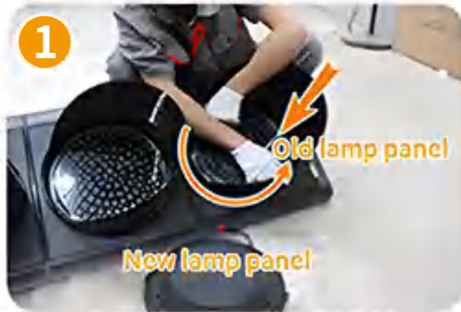
Remove the original lamp panel