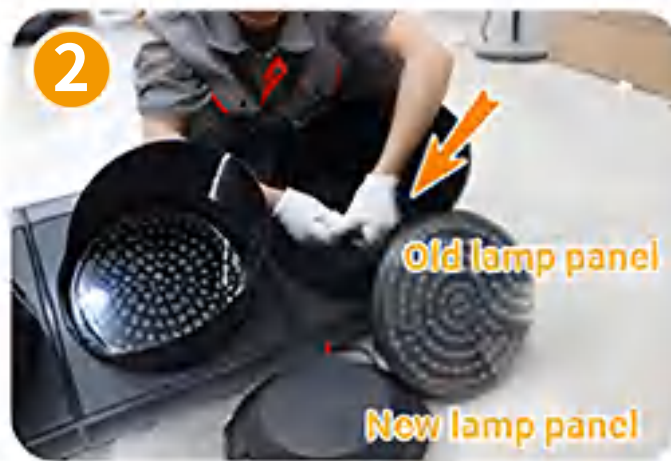
Insert new light cable